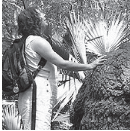
AURORA LEVINS MORALES, WRITER AND HISTORIAN, BERKELY, CA, 2005 (PRE-KATRINA)

River Residencies provide sustained quality work time in contact with the Mississippi; time in which one can experience and study the river using it as a catalyst to create art that contributes to our awareness of the river, its needs and its gifts to all life. Funded by the Louisiana Division of the Arts and the Tulane/Xavier Center for Bioenvironmental Research with a grant from the Aron Foundation Charitable Trust.